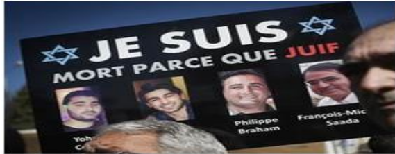
Paris protest sign reads, "I'm dead because I'm a Jew"

A rap fan, a student, two family men: below are the profiles of four Jews who were murdered in last Friday's Islamist terrorist attack on a kosher supermarket in Paris. Buried on Tuesday in Jerusalem with thousands in attendance, they were slain by jihadist Amedy Coulibaly during a five-hour hostage siege that ended when commandos launched an assault on the store, killing the attacker.