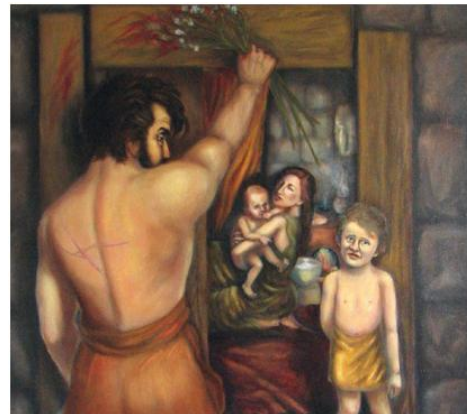
Marking the doorposts and lintel of the Israelites