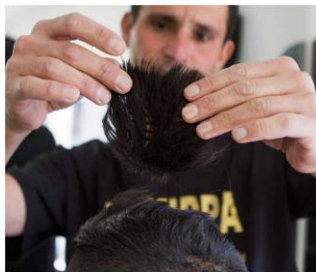
Fitting a "Magic Kippa"

The Associated Press reported today that, in response to the increasing numbers of anti-Semitic attacks in Europe, an Israeli barber has designed yarmulkes that blend in with the wearer's hair. Called the "Magic Kippa," the head coverings, made of synthetic hair, are washable, brushable and dyeable. Inventor Shalom Koresh told the AP he invented them so that observant Jewish men "could feel comfortable going to places where they are afraid to go, or places where they can't wear it and feel secure." He noted that the yarmulkes, which sell online for $56 and up, are particularly popular with French and Belgian buyers. Koresh may also want to consider marketing in Malmo, Switzerland. In a sort-of riff on the viral "Walking Around New York City While Female" video, a Swedish reporter recently walked around the heavily Muslim city while wearing a kippah and secretly recorded the reactions he received. In footage that aired on Swedish television this week, he was hit once and cursed at by numerous passersby.