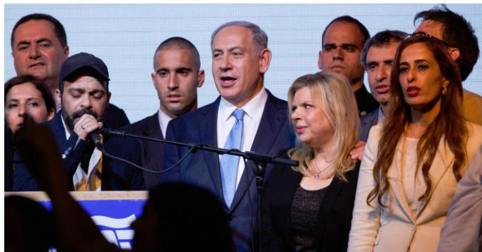
Netanyahu's family and supporters sing Hatikvah at his reelection

TEL AVIV (JTA) — On Sunday night, when Prime Minister Benjamin Netanyahu ascended the stage to address the crowd, he needed their votes. On Tuesday he got them. “[A]s long as I am prime minister, and as long as Likud is in government, the nationalist camp is in government,” he said in his speech at the rally. “And as long as the nationalist camp is in government, we won’t divide Jerusalem, there won’t be concessions and there won’t be retreats.” Now Netanyahu has what he said he wanted when he called in December for new elections: a relatively easy path to forming a coalition with his so-called “natural partners.”