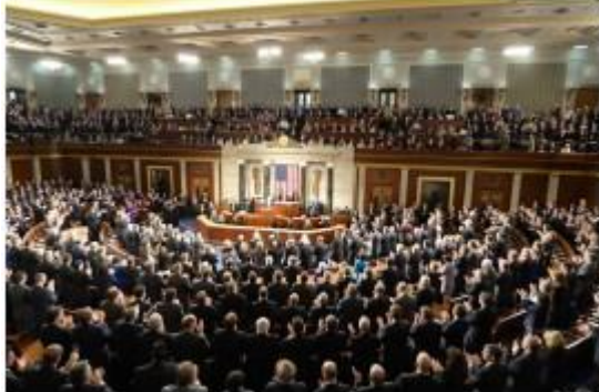
Benjamin Netanyahu delivers his message to Congress

JERUSALEM (JTA) – In his address to Congress, Israeli Prime Minister Benjamin Netanyahu argued that the proposed nuclear deal being negotiated with Iran will lead inexorably to a nuclear-armed Iran and war in the Middle East. “This deal has two major concessions: One, leaving Iran with a vast nuclear program, and two, lifting the restrictions on that program in about a decade,” Netanyahu said in his speech Tuesday morning. “That’s why this deal is so bad. It doesn’t block Iran’s path to the bomb, it paves Iran’s path to the bomb.” Netanyahu argued that the deal under consideration, which is being negotiated with Iran by the United States and other world powers, would let most of Iran’s nuclear infrastructure stay in place, including thousands of centrifuges. That would leave Tehran with a very short “breakout time” with which it could produce nuclear weapons, he said. Netanyahu concluded his speech with a biblical quote from Moses, first in Hebrew, then in English. “Be strong and resolute, neither fear nor dread them,” he said, then added, “May Israel and America always stand together, strong and resolute.”