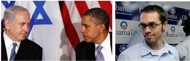
Netanyahu, Obama and Bird