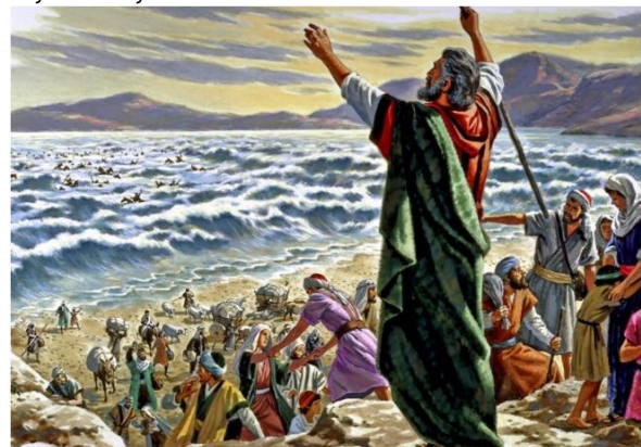
The waters close over the pursuing Egyptians

Soon after allowing the children of Israel to depart from Egypt, Pharaoh chases after them to force their return, and the Israelites find themselves trapped between Pharaoh’s armies and the sea. G-d tells Moses to raise his staff over the water; the sea splits to allow the Israelites to pass through, and then closes over the pursuing Egyptians. Moses and the children of Israel sing a song of praise and gratitude to G-d. In the desert the people suffer thirst and hunger, and repeatedly complain to Moses and Aaron. G-d miraculously sweetens the bitter waters of Marah, and later has Moses bring forth water from a rock by striking it with his staff. He causes manna to rain down from the heavens before dawn each morning, and quails to appear in the Israelite camp each evening. The children of Israel are instructed to gather a double portion of manna on Friday, as none will descend on Shabbat, the divinely decreed day of rest. Some disobey and go to gather manna on the seventh day, but find nothing. Aaron preserves a small quantity of manna in a jar, as a testimony for future generations. In Rephidim, the people are attacked by the Amalekites, who are defeated by Moses’ prayers and an army raised by Joshua.